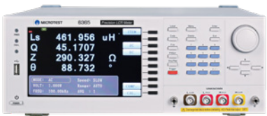
6363 / 6364 / 6365 / 6366 / 6367 / 6365A / 6365B