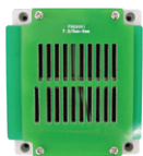
Customized fixture head