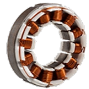
Motor stator coil

Unbalance DCR which happen on 3 phase motor may cause deflection on motor.